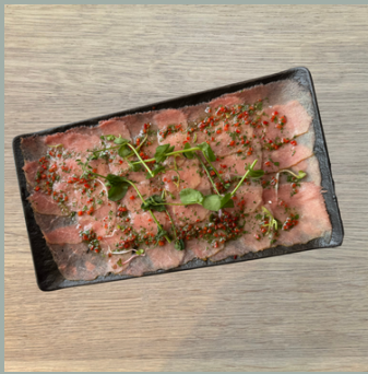
VEAL LOIN marinated veal loin with a chili, ginger and coriander dressing

Fresh, surprising & full of flavor – taste it now!