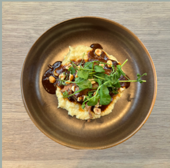
VEAL CHEEK with parsnip purée and hazelnuts