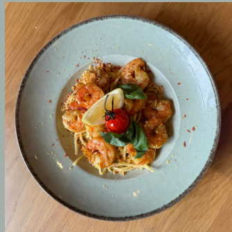
LIGUINE PASTA with prawns, garlic, lemon & basil 16.5