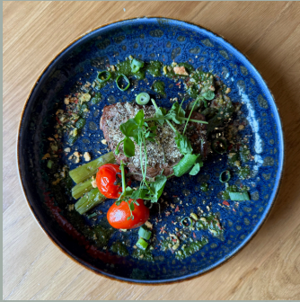
VEAL TENDERLOIN with herb crust, green asparagus & mint sauce 24.5

Fresh, surprising & full of flavor – taste it now!