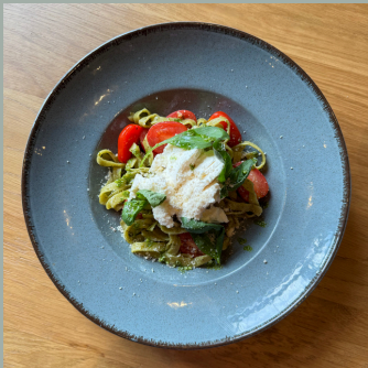
SUMMER PESTO PASTA with ricotta, zucchini, cherry tomatoes, peas & parmesan 13.5