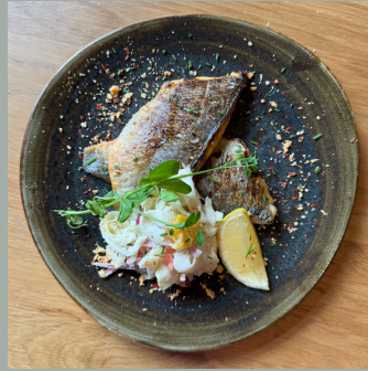
DORADE with a fresh fennel & citrus salad 19.5